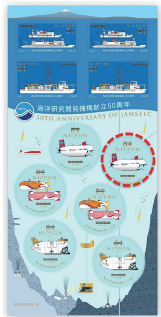
Fig. 3 Commemorative stamp for the 50th anniversary of the establishment of JAMSTEC, which was founded in 1971. The Shinkai 2000, depicted in a cute illustration, is a manned submersible for deep-sea scientific research using the bathyscaphe principle, completed in 1981 and registered as Japan's Mechanical Engineering Heritage No. 87 in 2017.

The fifth meeting was held a year and a half later, in November 1979 (Fig. 1). In order to reduce dependence on oil and to focus on the development of alternative energy sources, marine energy was also dealt with in this French-Japanese Ocean Development Sub-Committee. At this meeting, it was agreed to consider feasi-