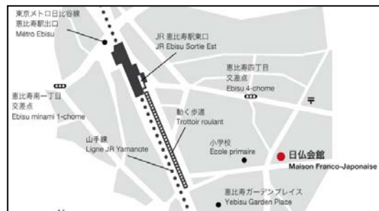
The hall of Nichifutsu Kaikan in Ebisu (●)